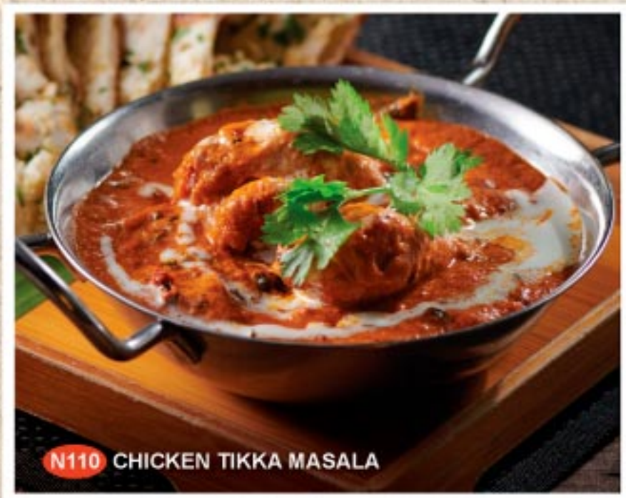
N110 CHICKEN TIKKA MASALA

Chicken cooked in a SOULed OUT classic spiced butter sauce. Choose pulao rice or paratha to complement.