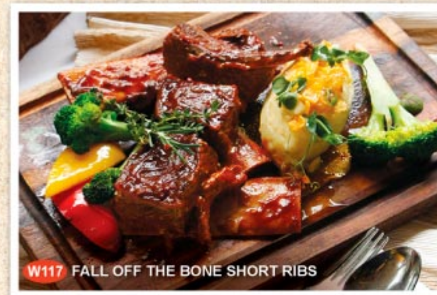
W117 FALL OFF THE BONE SHORT RIBS

Bone in short ribs rubbed with spices & braised till tender in red wine. Glazed with Guinness BBQ sauce & served with a creamy mash & sautéed panache vegetables.