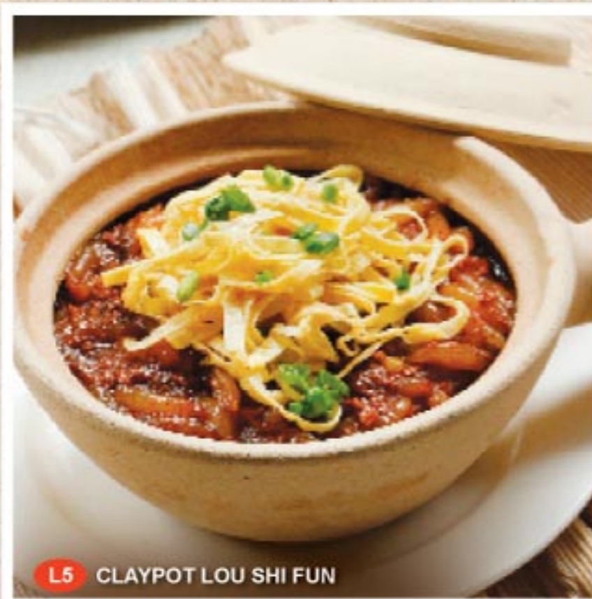
L5 CLAYPOT LOU SHI FUN

Short, thick rice noodles in a dark minced chicken mushroom sauce & topped with shredded omelette.