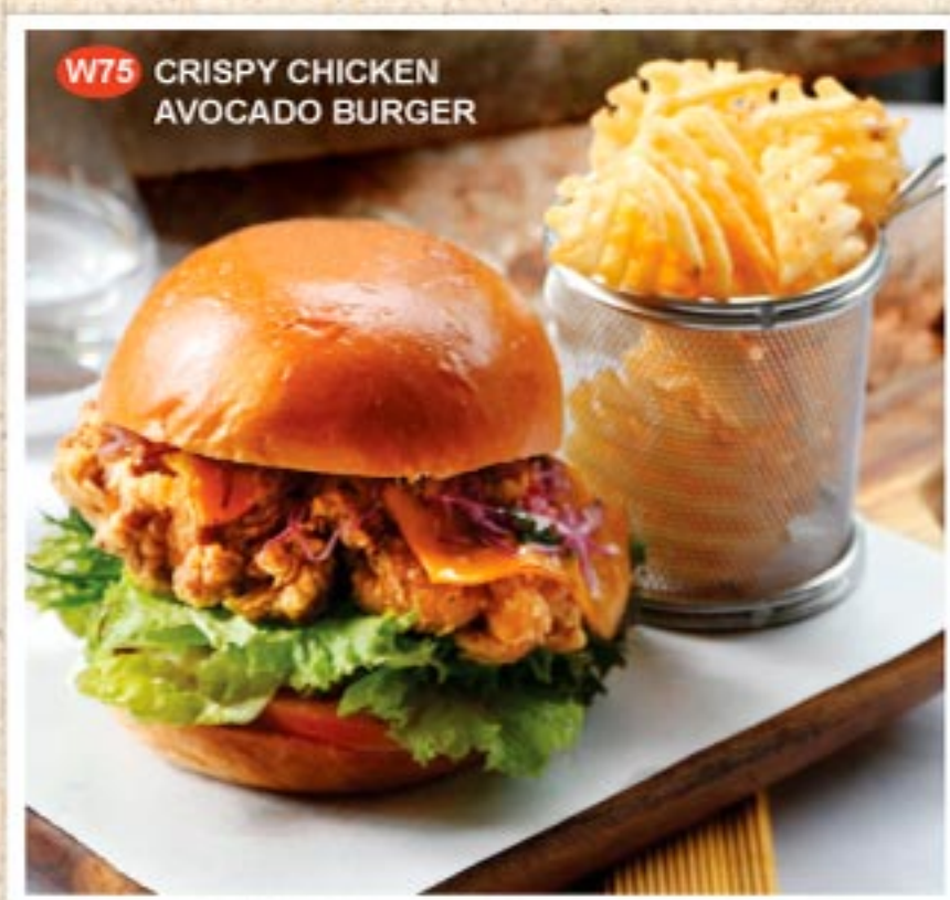
W75 CRISPY CHICKEN AVOCADO BURGER

Filled with a homemade chicken patty, Swiss cheese, guacamole, arugula, red cabbage, tomato & truffle sauce. Comes with waffle fries too!