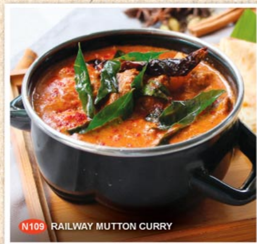
N109 RAILWAY MUTTON CURRY

Mutton is slow cooked in a blend of spices & coconut milk with your choice of pulao rice or paratha.