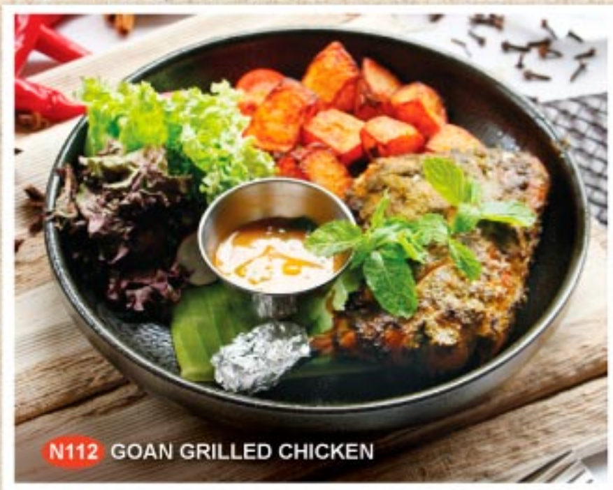
N112 GOAN GRILLED CHICKEN

Chef Sapna's secret recipe of chicken leg marinated in homemade green herbs & spices, charcoal grilled & served with crispy chilli sea salt potatoes & salad.