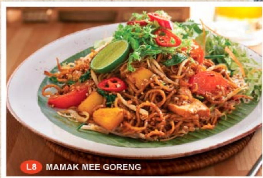
L8 MAMAK MEE GORENG

Crispy yee mee, drenched in a thick egg gravy with chicken & seafood. Ask for a side of chopped garlic and red chillies...yummm!