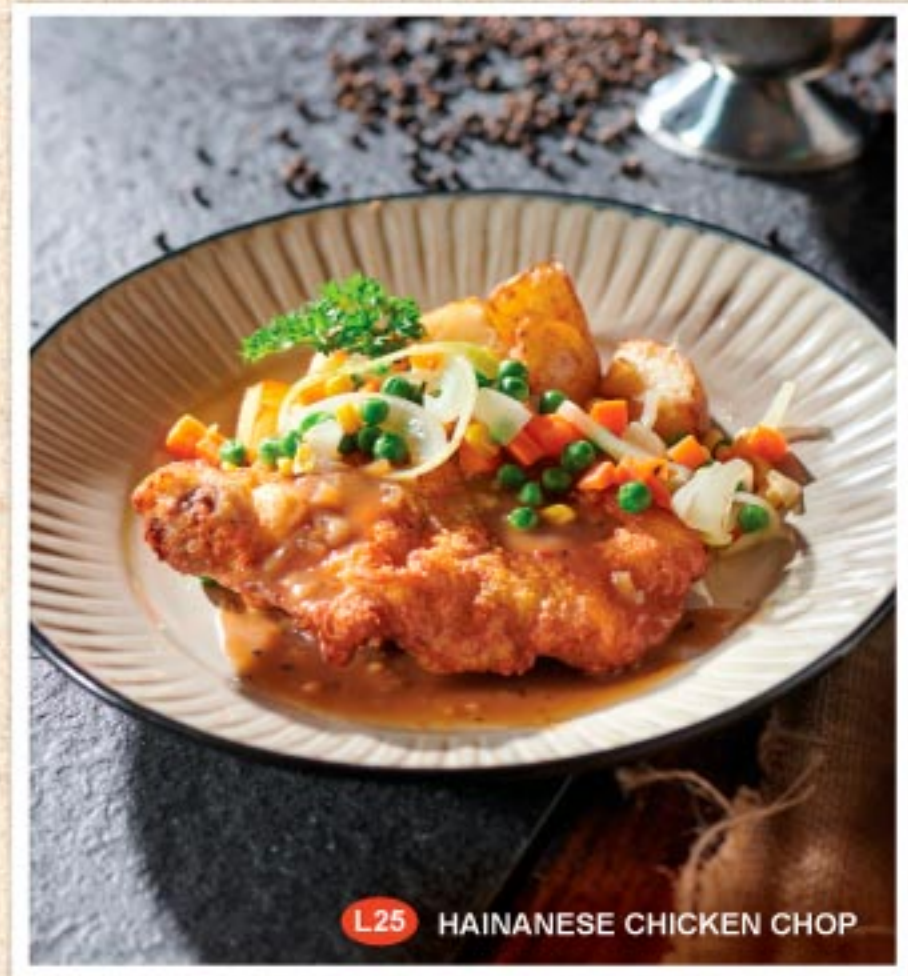
L25 HAINANESE CHICKEN CHOP

锅香炒饭 (牛肉 | 鸡肉 | 羊肉) Taste the old-styled 'wok hei' fried rice served with julienned egg & homemade sambal belacan on the side.