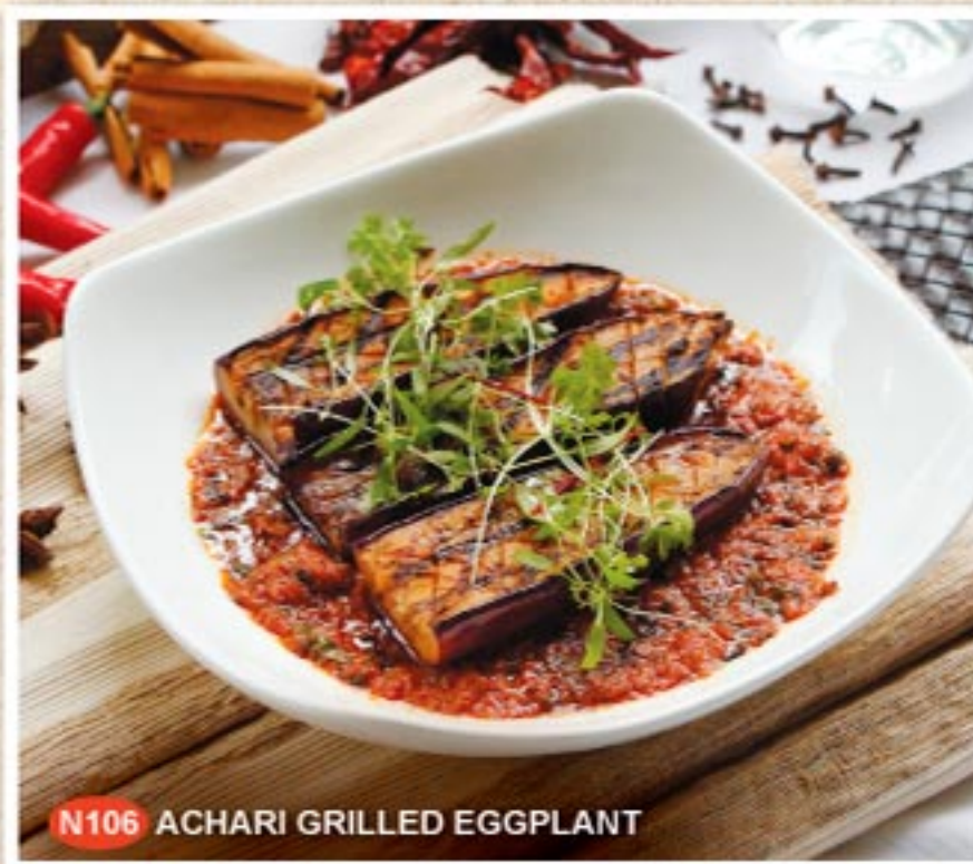
N106 ACHARI GRILLED EGGPLANT

A popular Northern Indian dish of paneer & green peas in a sweet creamy tomato Makhani sauce with your choice of pulao rice or paratha.