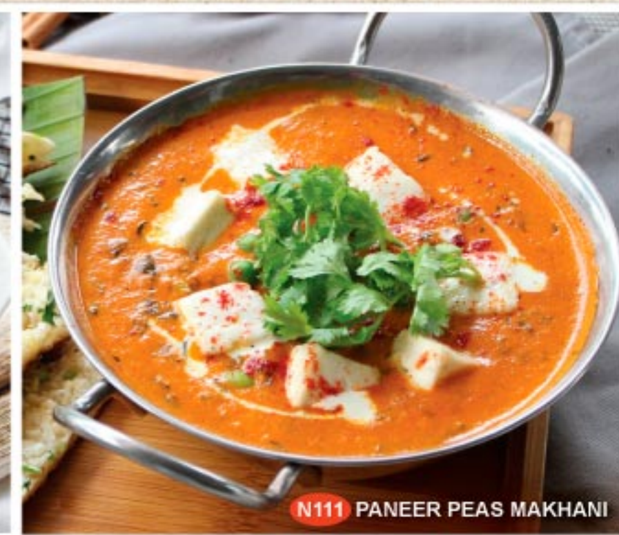
N111 PANEER PEAS MAKHANI