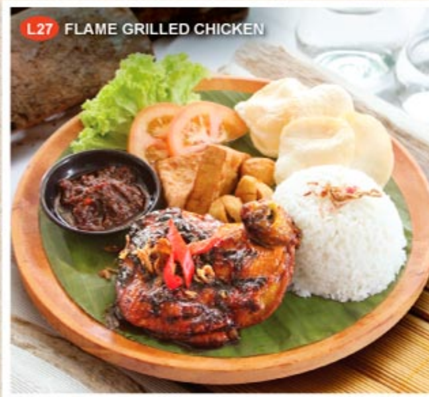
L27 FLAME GRILLED CHICKEN