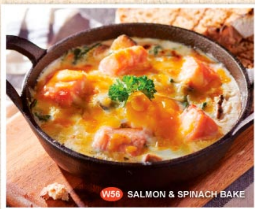
W56 SALMON & SPINACH BAKE