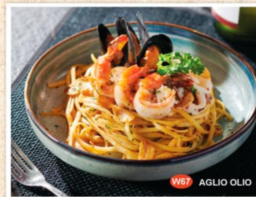
W67 AGLIO OLIO