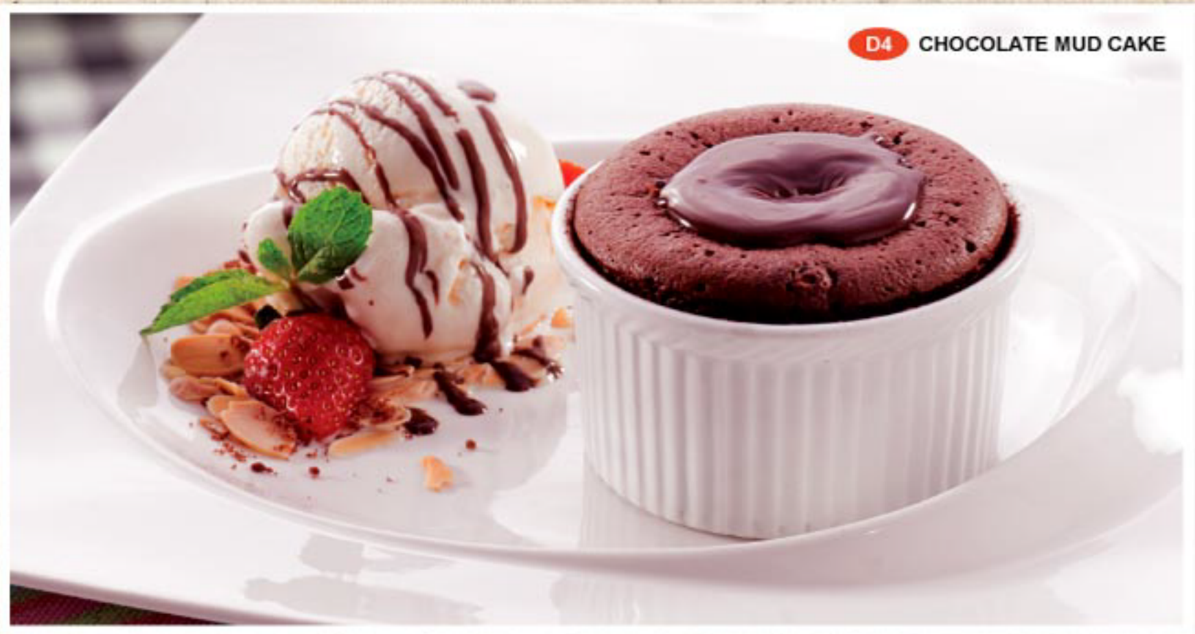
D4 CHOCOLATE MUD CAKE