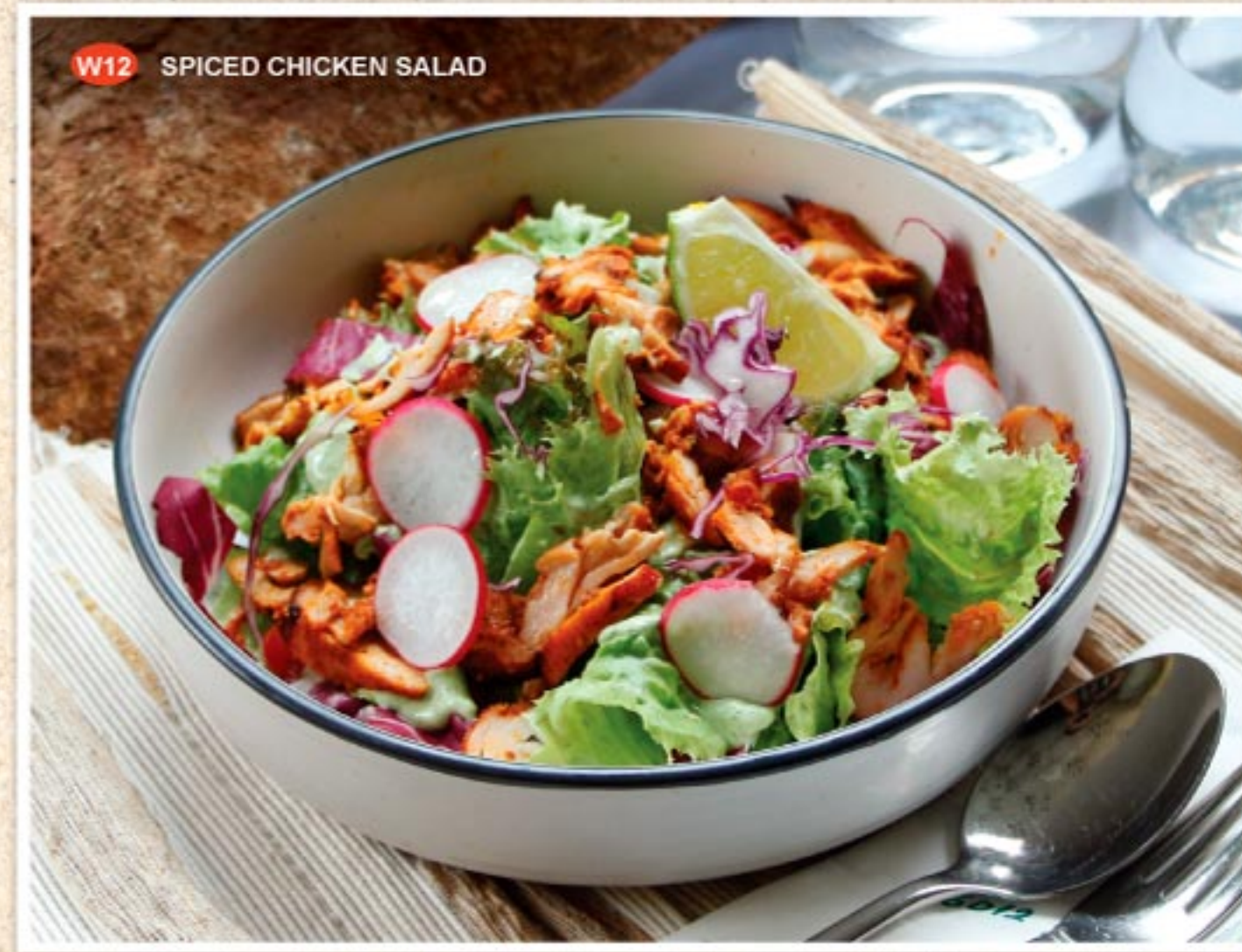
W12 SPICED CHICKEN SALAD

A delicious & hearty salad of sliced spiced chicken, pegaga leaves, watercress, cherry tomatoes, red onions, mixed leaves & a creamy avocado yoghurt dressing.