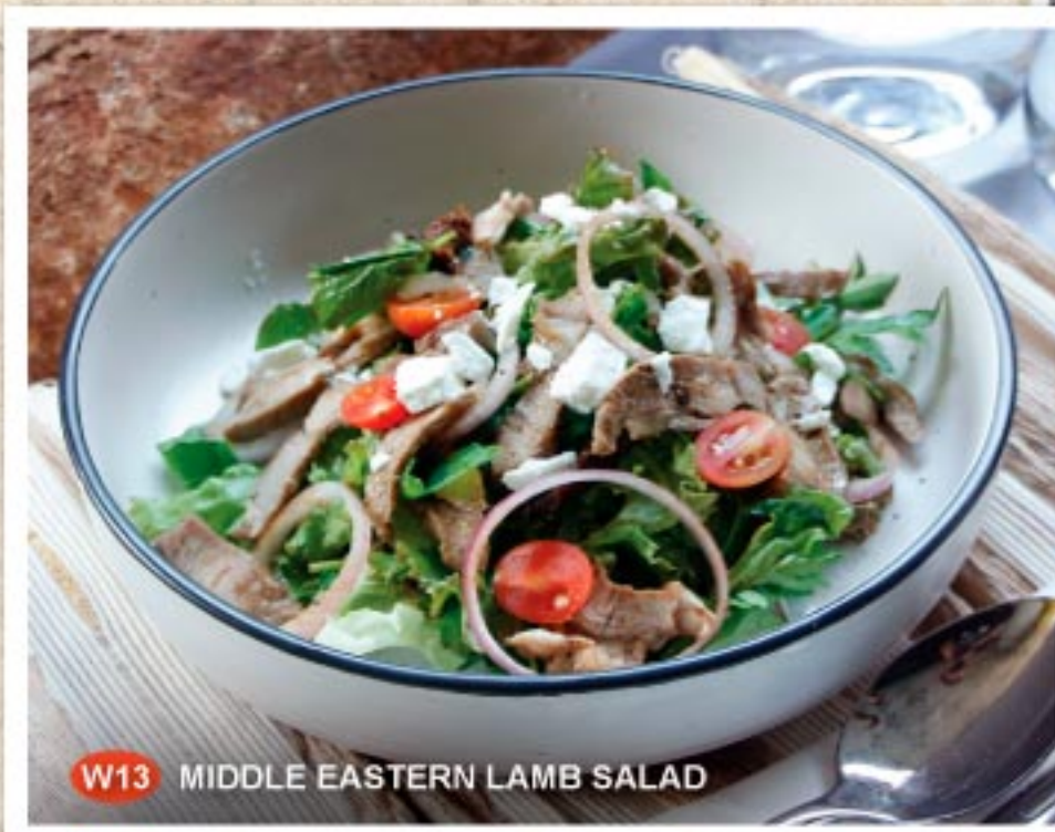
W13 MIDDLE EASTERN LAMB SALAD

Taste the exotic with a mix of tahini yoghurt spiced lamb, feta cheese, red onion, sundried tomatoes, mesclun with a tangy balsamic dressing.