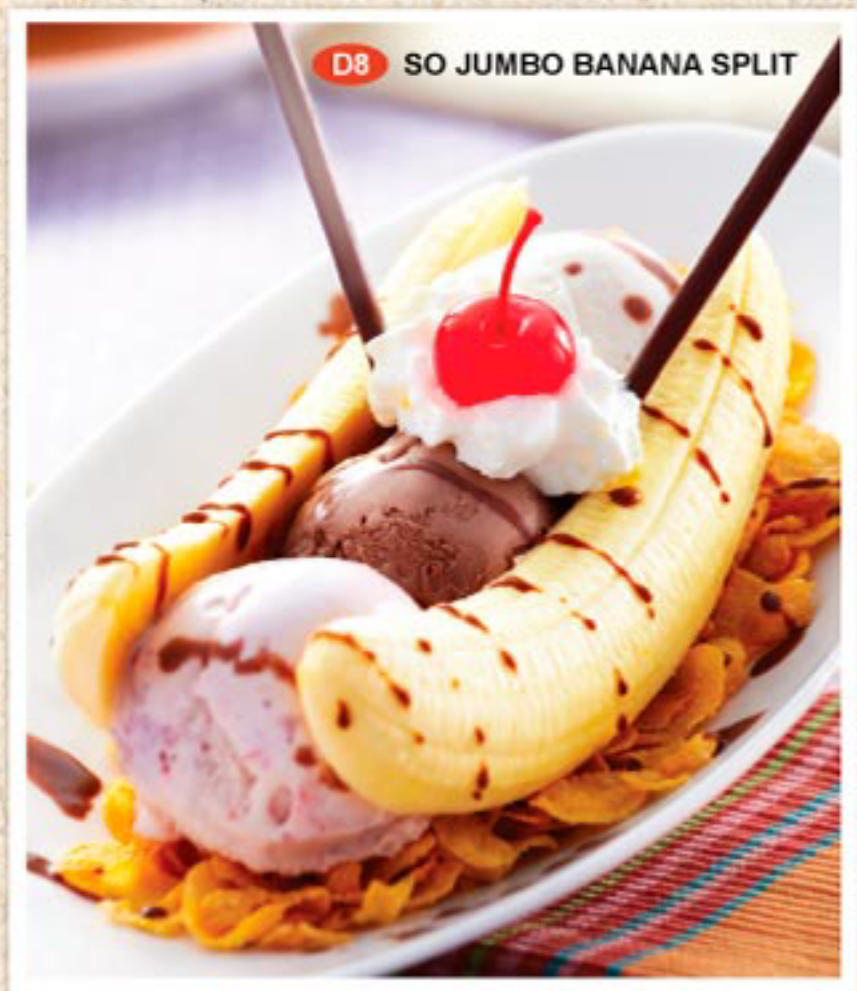
D8 SO JUMBO BANANA SPLIT

Your choice of 3 scoops of ice cream topped with chocolate, caramel sauces & whipped cream on a bed of cornflakes & flanked by a banana doing the split!