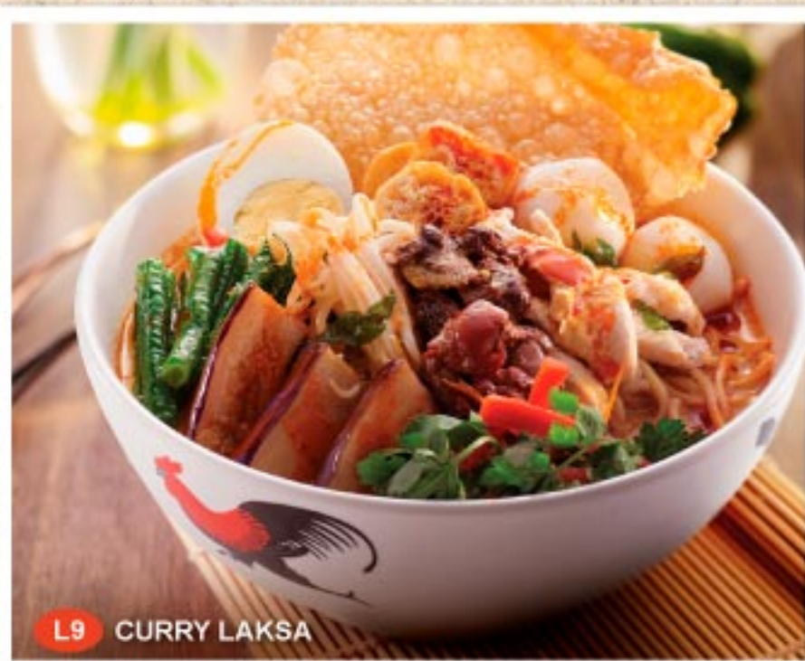
L9 CURRY LAKSA

A bowl of rich, spicy soup with noodles, shredded chicken, beancurd, egg, fresh cockles & beansprouts.