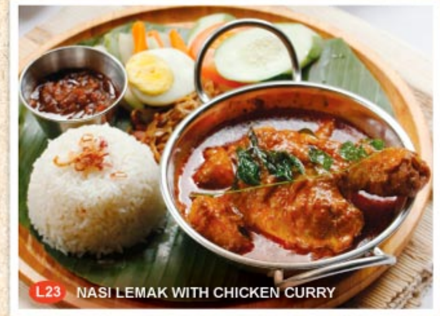
L23 NASI LEMAK WITH CHICKEN CURRY

L23 Nasi Lemak with Chicken Curry 38 椰浆饭配咖喱鸡