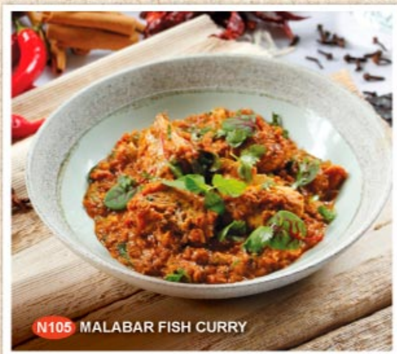
N105 MALABAR FISH CURRY

Spanish mackerel cooked in ginger, curry leaves, spices & coconut milk, served with fragrant spiced pulao rice or paratha for a real hearty meal.