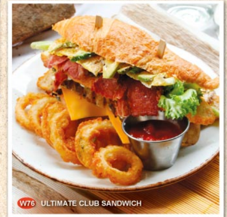
W76 ULTIMATE CLUB SANDWICH

Tackle this behemoth of a 3 layer croissant, loaded with beef bacon, spiced chicken, fried egg, cheddar cheese, avocado, tomato, lettuce & tomato chutney. Comes with a side of onion rings.