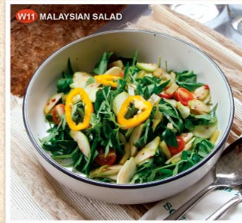
W11 MALAYSIAN SALAD