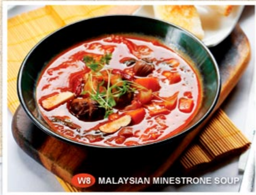
W8 MALAYSIAN MINISTRONE SOUP

A creamy mix of 7 types of mushrooms, served with sauteed shiitake, a drizzle of truffle oil & garlic bread.