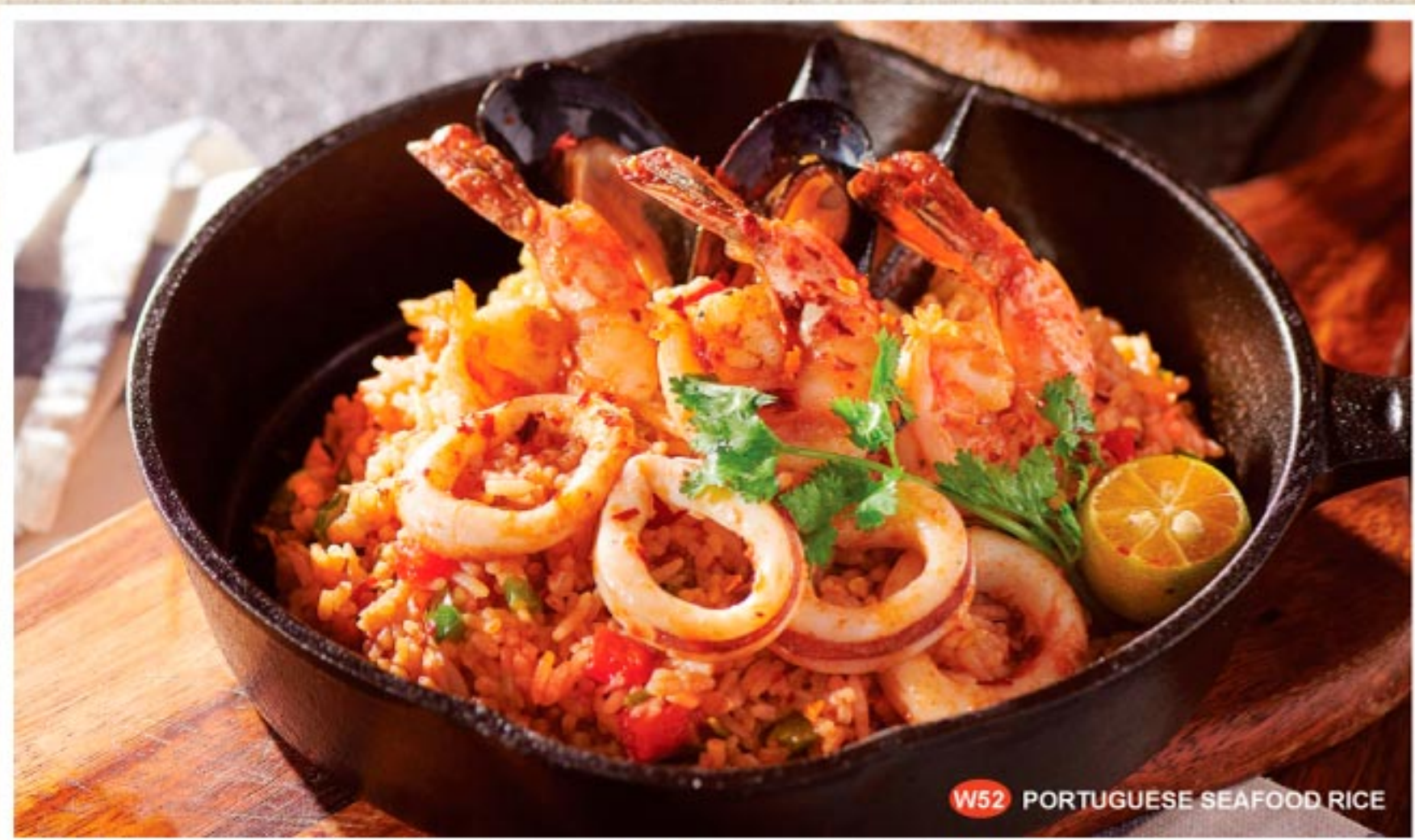
W52 PORTUGUESE SEAFOOD RICE