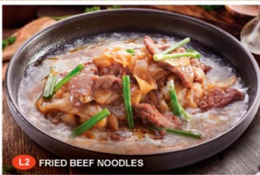
L2 FRIED BEEF NOODLES

Just as good as it was since we opened waaaay back in 1996. Delicious flat rice noodles in a thick eggy gravy with slices of tender succulent beef, spring onions & ginger.