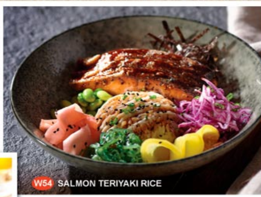
W54 SALMON TERIYAKI RICE

Scrumptious ensemble of salmon in teriyaki sauce, Japanese rice topped with red cabbage, chuka wakame, edamame & nori.