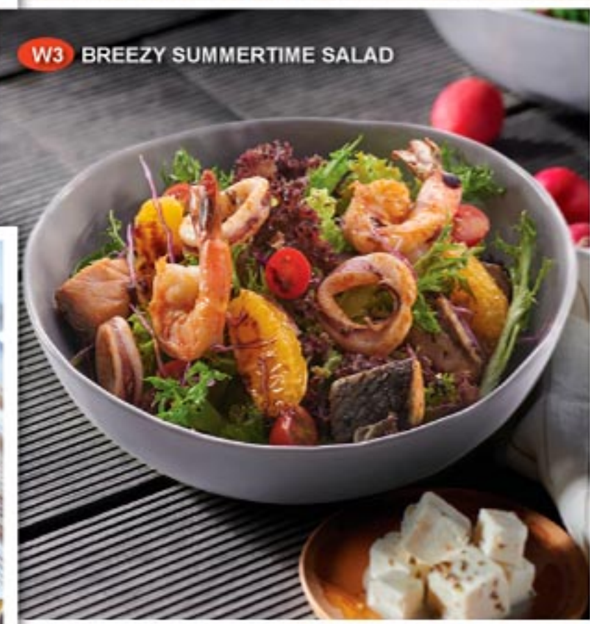
W3 BREEZY SUMMERTIME SALAD

The flavours of summer with grilled salmon, squid & prawns on mixed greens with watercress, garnished with orange salsa, honey glazed beetroot & homemade orange vinaigrette.