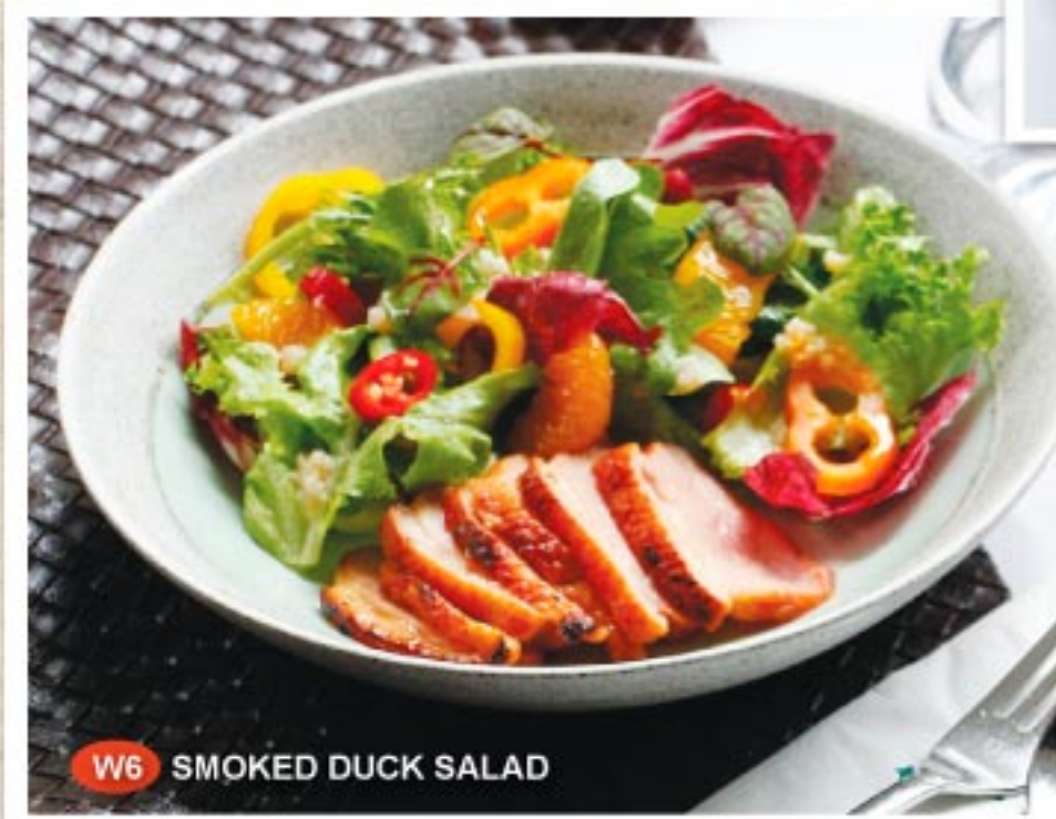
W6 SMOKED DUCK SALAD

A medley of vegetables simmered in a tomato based broth & finished with a sprinkling of parmesan & toasted bread.