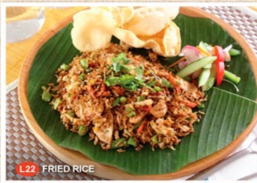
L22 FRIED RICE

An Indonesian inspired dish of boneless chicken thigh braised in spices & finished in a soy glaze over an open fire, served with white rice, fried tofu, shrimp crackers & tempeh sambal.